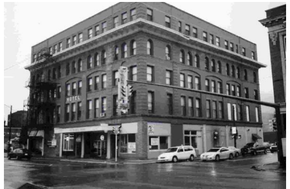
The Holley Hotel with fifth floor added in 1931.