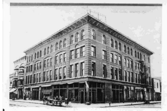
The original Holley Hotel in 1901.

The hotel is supplied with 75 sleeping apartments, elegantly furnished and so arranged that each is an outside room".